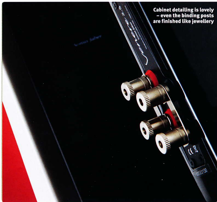
Cabinet detailing is lovely – even the binding posts are finished like jewellery