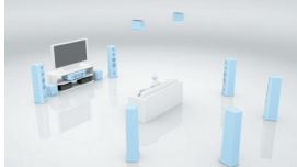
Dolby Atmos 7.2.2ch Speaker System

The SC-LX801 is compatible with 7.2.2ch/5.2.4ch configuration of the latest DOLBY ATMOS® cinema sound platform, Dolby Atmos®. You can reproduce object-oriented sound in smooth, curving movements, or the realistic three-dimensional movement overhead by the top speakers.