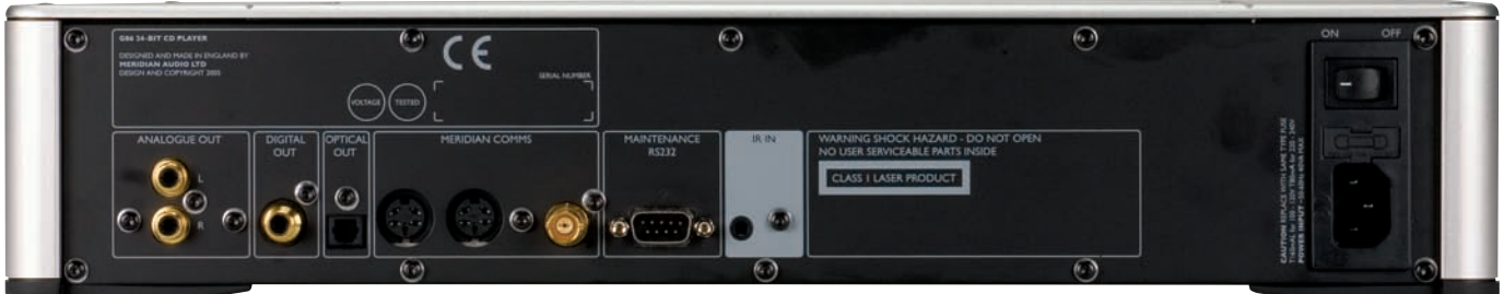
G06 rear panel – silver model shown