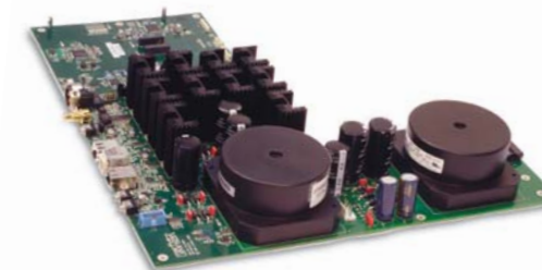
Main PCB, featuring separate analog and digital toroidal power transformers. Oversized, extruded heatsinks for each individual voltage allow the system to run cool.

The N°512 is the first dedicated high-resolution playback source device to carry the Mark Levinson name. In addition to unlocking the impressive dynamics of the SACD format, the N°512 is designed to extract the very best from your existing CD collection. There's no doubt that the N°512 will open a new world of listening enjoyment.