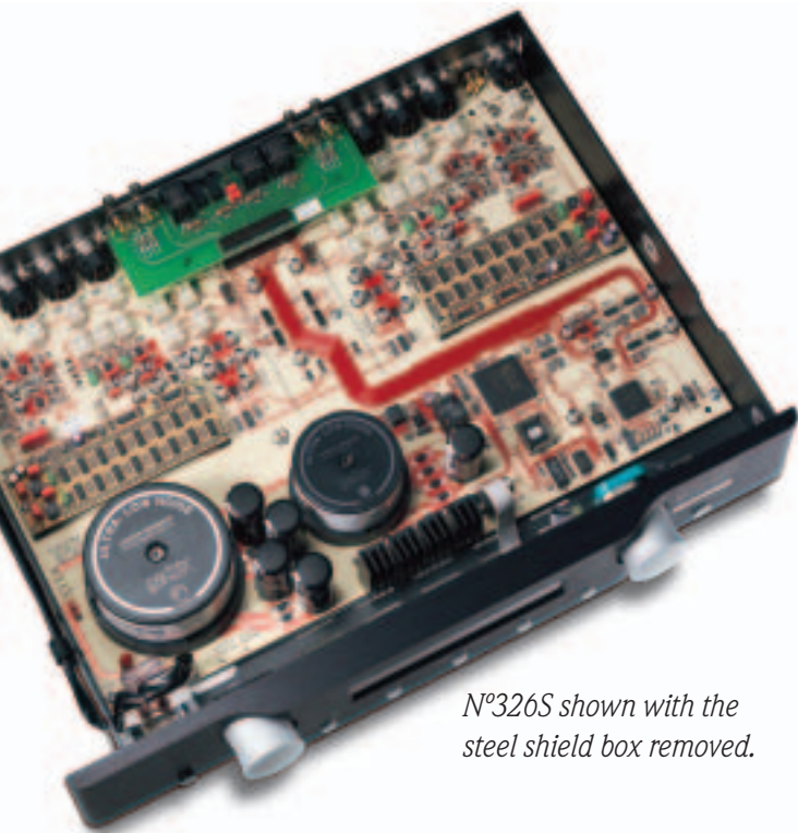
N°326S shown with the steel shield box removed.

The rear panel includes separate main and record output connectors, as well as two Link communication ports that make it possible for the N°326S to be included in Mark Levinson Link systems.