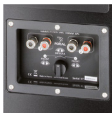
Bi/Twin mode selection