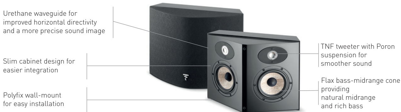
Aria SR900 Black Satin

Aria SR900 is a 2-way bipolar surround loudspeaker with the same acoustic characteristics as the other loudspeakers in the Aria range. Composed of two 5" (13cm) woofers with Flax sandwich cones, it provides very high-definition and natural sound. For the treble register, there are two aluminium/magnesium inverted dome tweeters with Poron suspension and a waveguide for a better control of directivity. Thanks to the Polyfix wall-mounting system provided, the compact SR900 loudspeaker is easy to integrate into your interior.