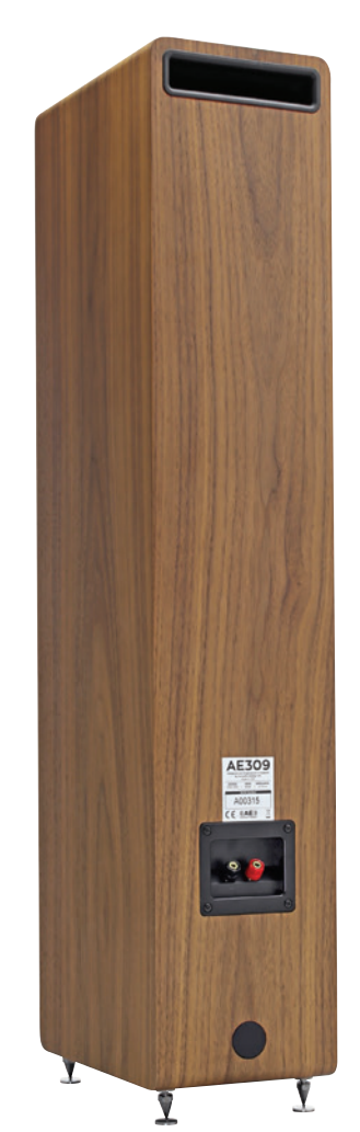
Veneered all round, a slot reflex port at top and a mass loading port at bottom.

thought it was an artificial veneer. Oh sad. But it is well applied for a smooth edge finish and full coverage, including the rear panel. There are gloss black and white finish alternatives.