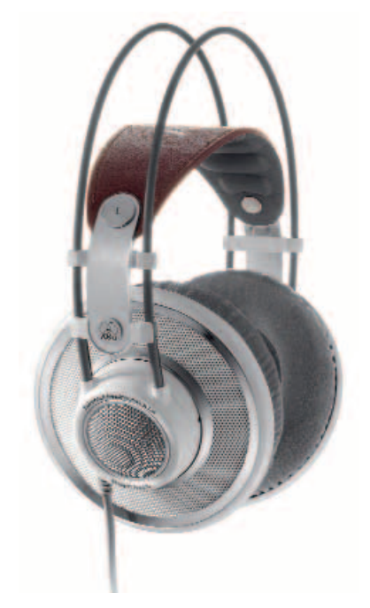
AKG Acoustics K 701 headphone

DESCRIPTION Open-back, circumaural, dynamic headphones with neodymium magnet system. Frequency range: 10Hz–39.8kHz. Impedance at 1kHz: 62 ohms. Sensitivity: 105dB/V. Maximum input power: 200mW. Acoustic seal: open. Ear coupler: full size. Driver: dynamic. Coupler: large. Cable: 99.99% OFC, "balanced" (separate ground for each channel). Cord: 10', straight, left side. Connector: ¼".